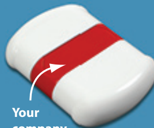
Your company logo here

The table on the right shows the various order sizes available. Please call or email for more information on customizing and pricing for each order size.